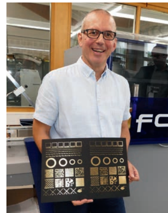
Decorative metallic effects are excellent for logos, fonts, surfaces and also images.