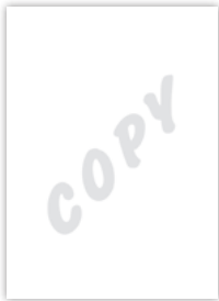
Neutral certificate paper Original with watermark (coat of arms Baden-Württemberg). "COPY" appears with each copy.

Protect your certificates from manipulation! With watermark and additional copy protection your certificates are safe.