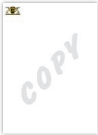
Graduation certificate coloured Original with watermark (coat of arms Baden-Württemberg). "COPY" appears with each copy.