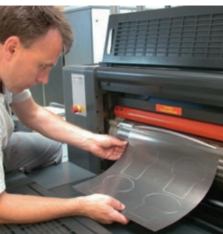
The inline die-cutting plate is fitted on the magnetic cylinder of the UV offset press.